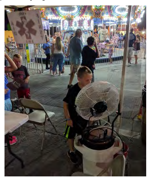
Misting fans being put to use at the EI Do Picnic!